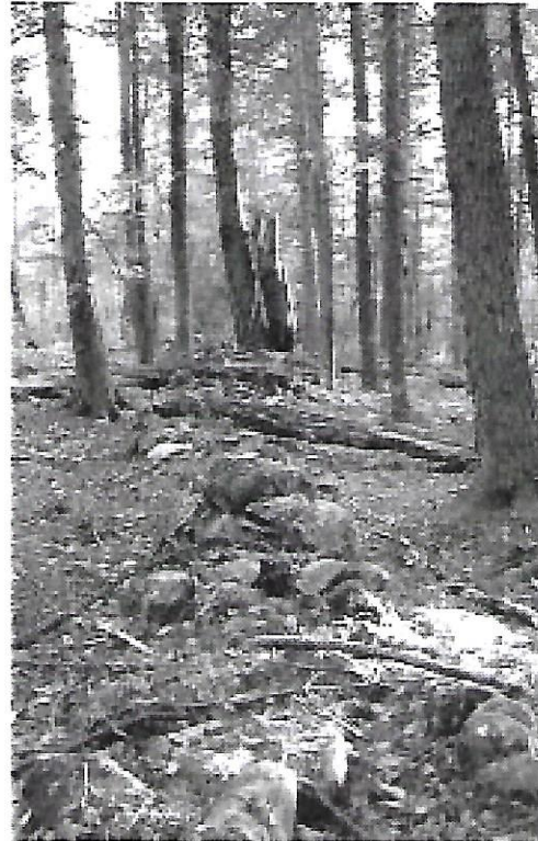
View of the Bassett-Kell property

To endeavor to maintain the rural character of our area for present and future generations by protecting its diverse natural resources through the conservation and stewardship of significant lands. To engage in and promote the scientific study of and education regarding natural resources. To use all properties held or controlled by the Land Trust and the net earnings thereof for the benefit of the general public and for charitable, educational, recreational, conservation, scientific and historical purposes.